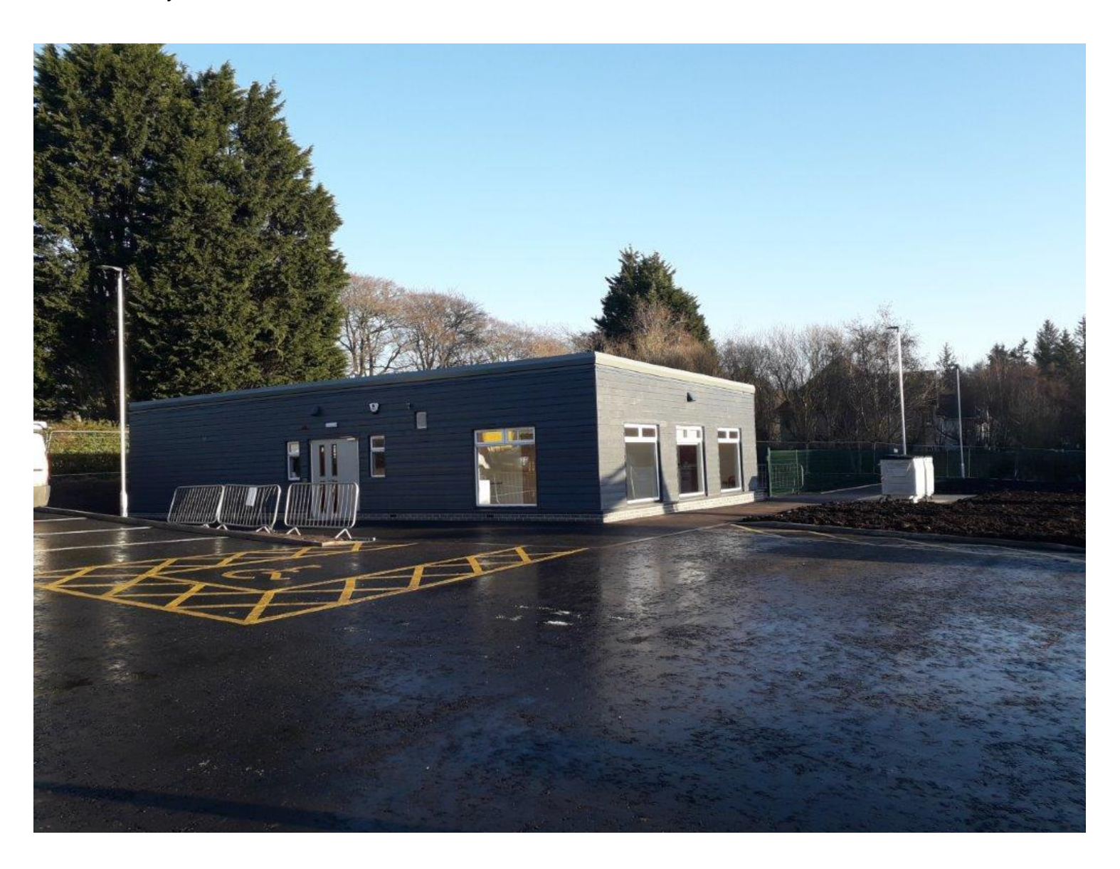
Appendix 2 – Sample of the Completed Projects Hazlehead Outdoor Nursery